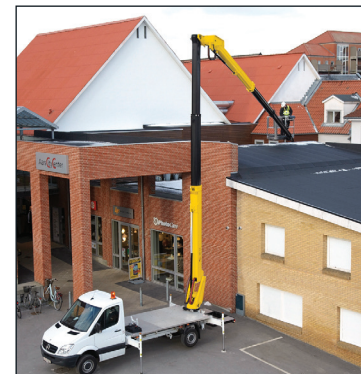
The ability to work over rooftops to access difficult to reach areas is aided by a flat bottomed basket