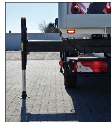
Compact H-frame outriggers

The photographs in this brochure are for promotional purposes only. Specifications are subject to change without notice.