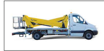
Low travel height