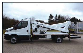
Also available on 3.5T GVW Iveco Daily 35S