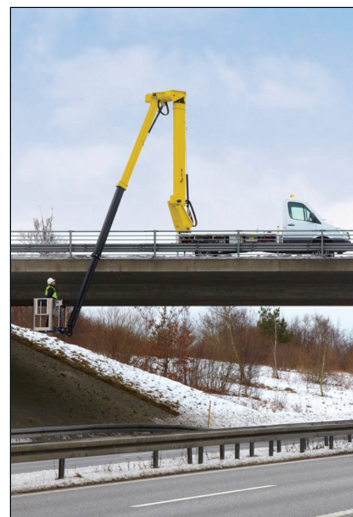
Ability to access below ground