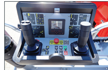
Easy to use full proportional (FPC) CANbus controls with display